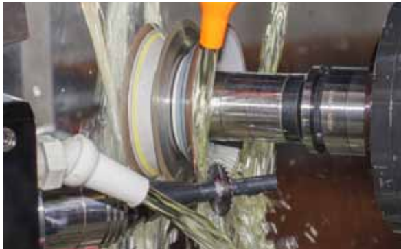
Our regrinding service for high standards.